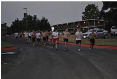
Early morning PT running

When they push beyond their perceived limits they amaze themselves and each other!