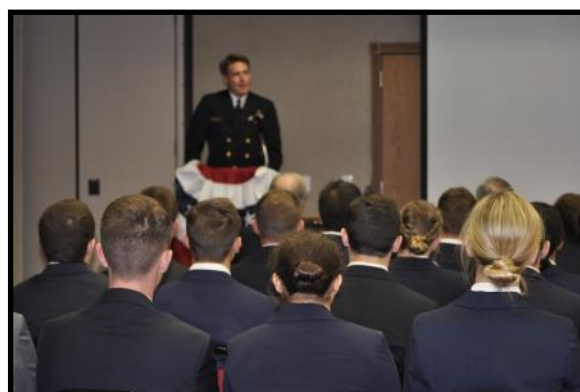
The Klocko Leadership Lecture is an annual event hosted by Greystone to expose our students to military leadership across all branches. Our hope is that the Greystoners will take these lessons to heart and use them in the field or fleet.

facebook.com/ GreystonePreparatorySchool